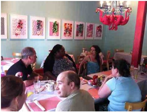
Meeting with the Baltimore Art and Social Justice Project at Café Hon, a restaurant that celebrates Baltimore's "kitsch" culture in the Hampden neighborhood