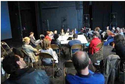
At the Des Voix Festival roundtable on playwriting from different international perspectives at Z Space in San Francisco