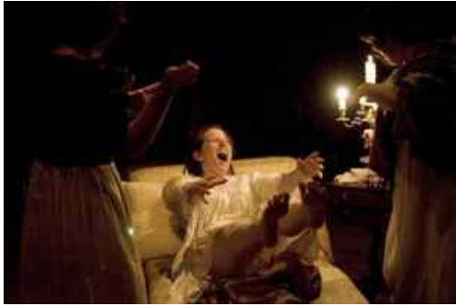
The Rude Mechanicals' production of their original work Now Now Oh Now at the Off Center in Austin, TX.